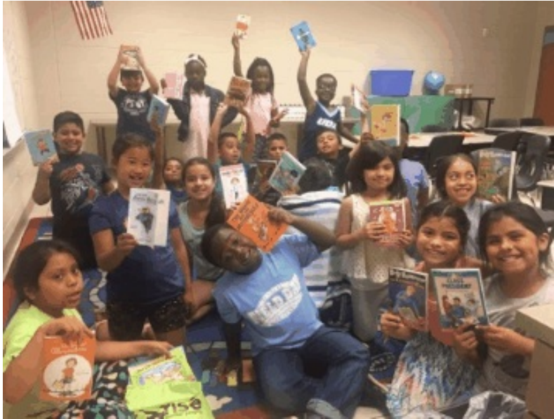
Fair Street is the epicenter for many summer programs

Each year Fair Street International Academy proudly houses a myriad of summer programs, where hundreds of students pass through the school's doors each day. Children come to Fair Street during the summer months to learn and have fun in programs offered by the Boys and Girls Club and the GCSS Migrant program.