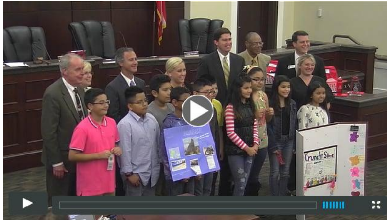
Gainesville City Schools Board of Education Video Regular Meeting - March 19, 2018