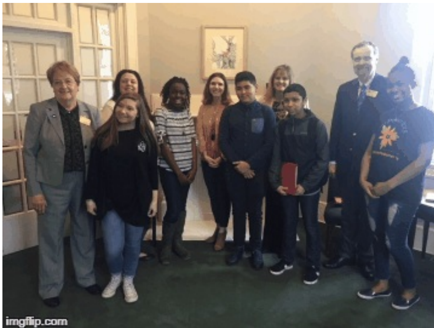
GMS Reach Scholars experience college life

On February 15th, Gainesville Middle School's REACH Scholars had the pleasure of visiting Brenau University. Touring the campus was exciting for the students, and the experience sparked their academic interest through engaging activities.