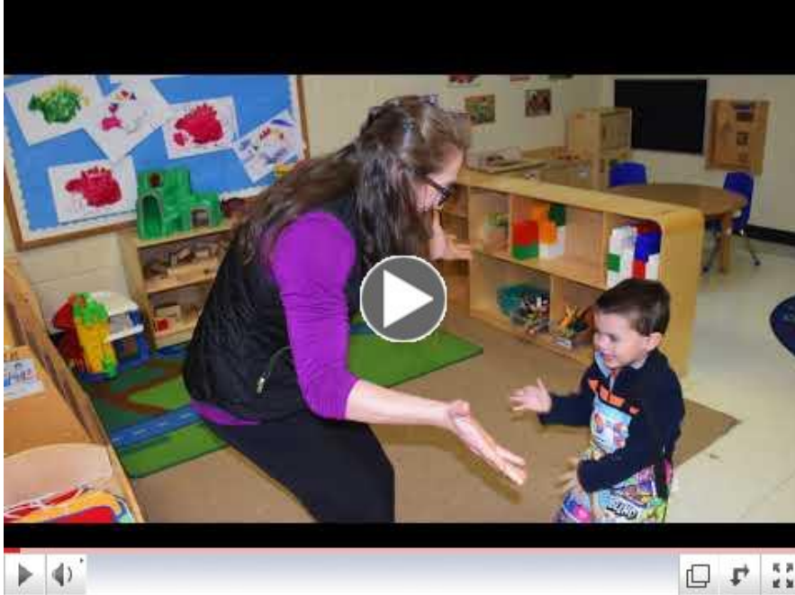
GCSS School Nutrition "Behind the Scenes" Video

As the district highlights National Nutrition Month throughout the month of March, our amazing School Nutrition staff are featured working "behind the scenes" to ensure that the program meets all state and federal guidelines and complies with all safety and health standards. These ladies work diligently each day to ensure that the district remains in compliance with regulations and create menus that provide food options that are healthy and nutritious. They even manage to find time to give back to the community by advocating the importance of good nutrition.