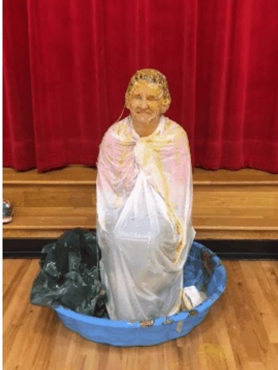
Teachers and principal get slimed