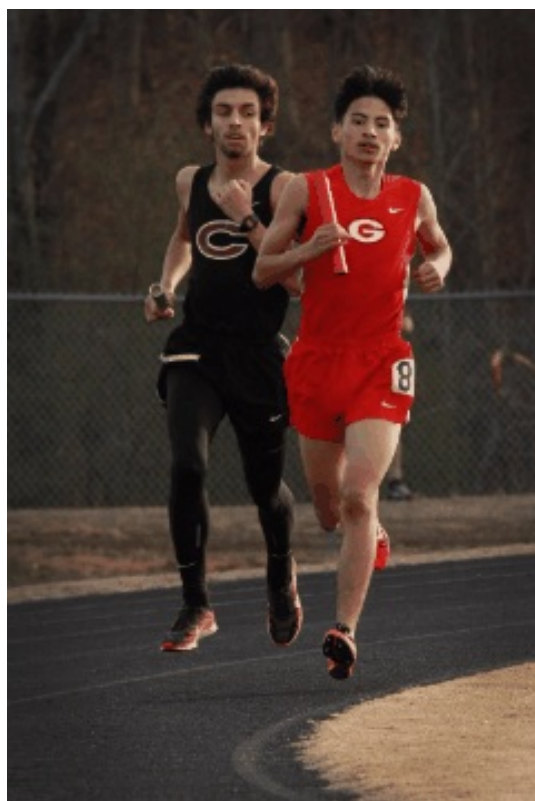
Track teams compete at West Hall

On Friday, February 17th, the Gainesville High School Boys and Girls Track teams competed in the West Hall Relay Invitational at West Hall High School where the girls finished third place overall and the boys finished in first place overall. A total of twelve teams around the region competed in the event.