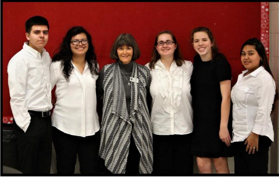
FCCLA claims STAR awards at regional competition