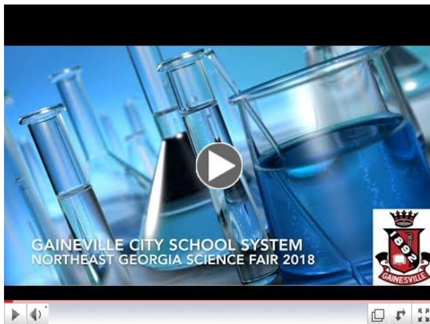
2018 Northeast Georgia Science Fair

On February 2nd, students in grades 6 - 12 participated in the Northeast Georgia Science and Engineering Fair at the Oconee Civic Center in Watkinsville, Georgia. First place winners will compete in the Georgia Science and Engineering Fair on March 22-24 at the Classic Center in Athens. Check out the video of Gainesville Middle and Gainesville High Schools' 2018 Regional Science Fair winners