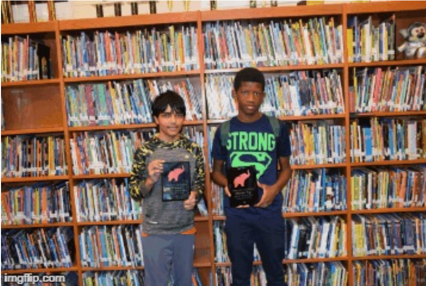
GMS Spelling Bee