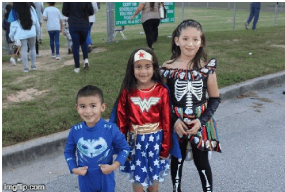
New Holland's Fall Festival

New Holland's students and parents enjoyed an exciting afternoon at the school's annual Fall Festival. With lots of activities, games, and food, everyone had a wonderful time during perfect fall weather. What a great way for families and staff to come together for a few hours of hay rides, face painting, art activities, and much more!